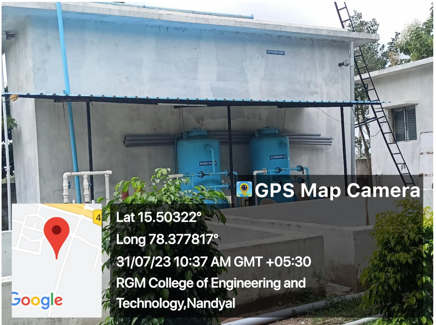
Waste Water Recycling /Management System