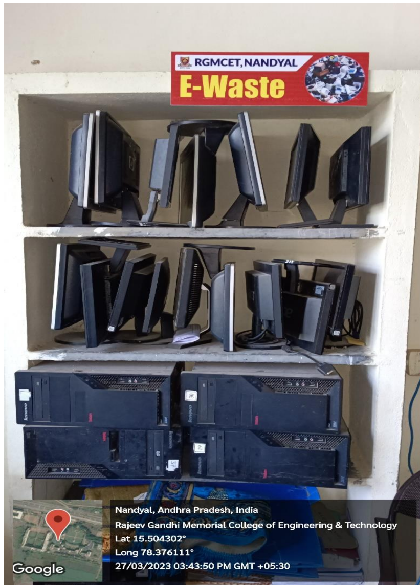
E-Waste Management System.