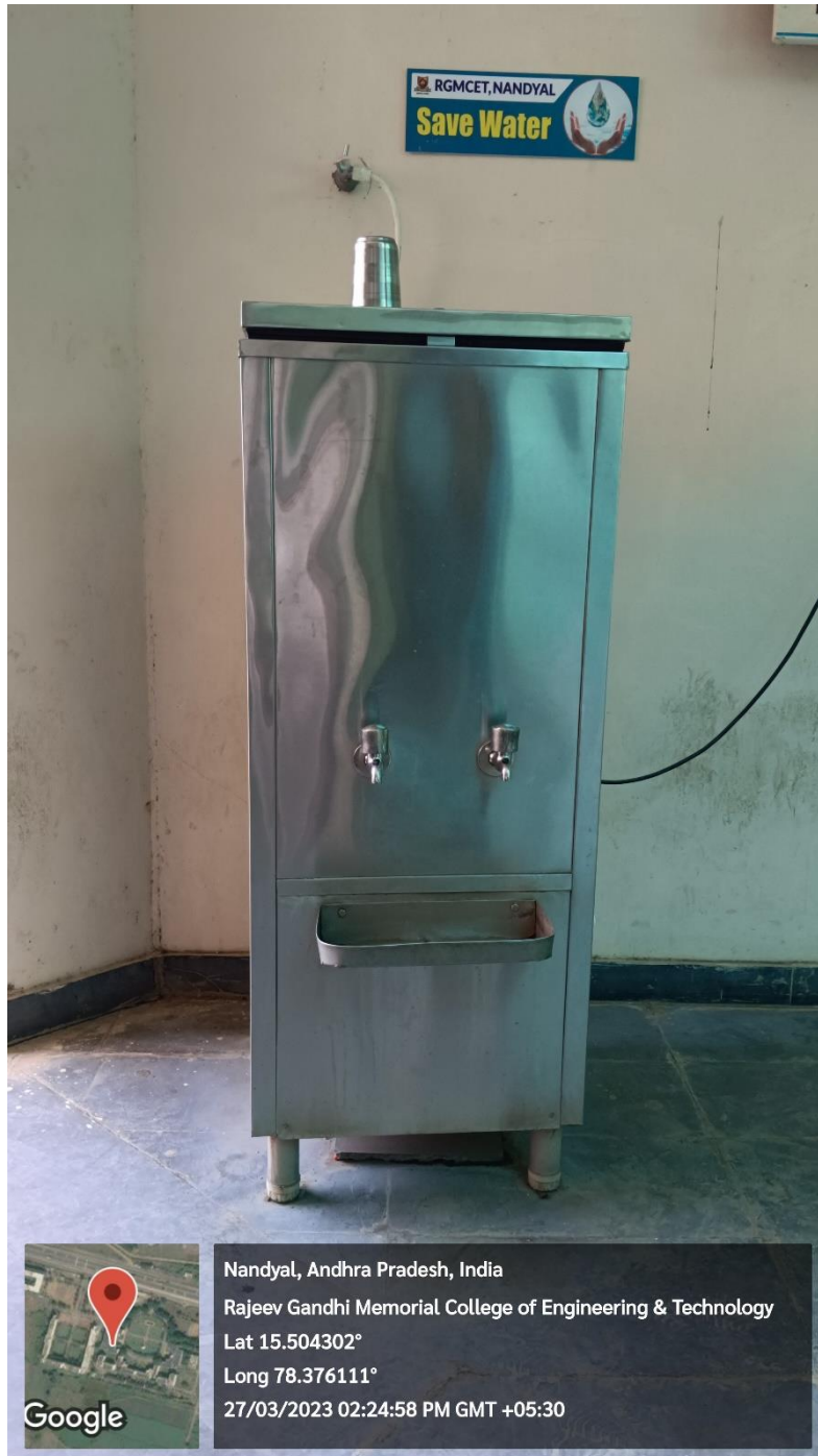
Display Boards regarding water Conservation