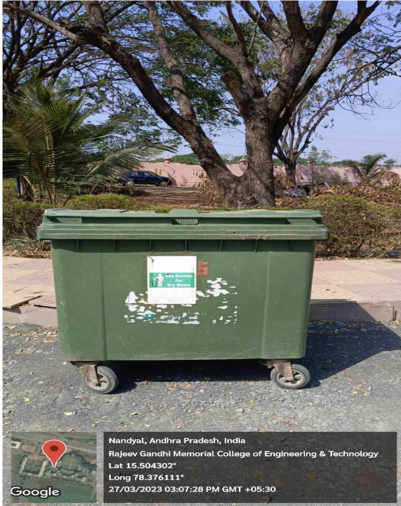
Solid Waste Management System