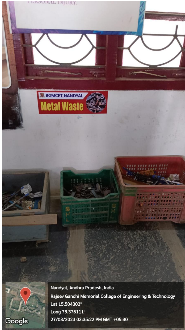
Metal Wastage Segregation System