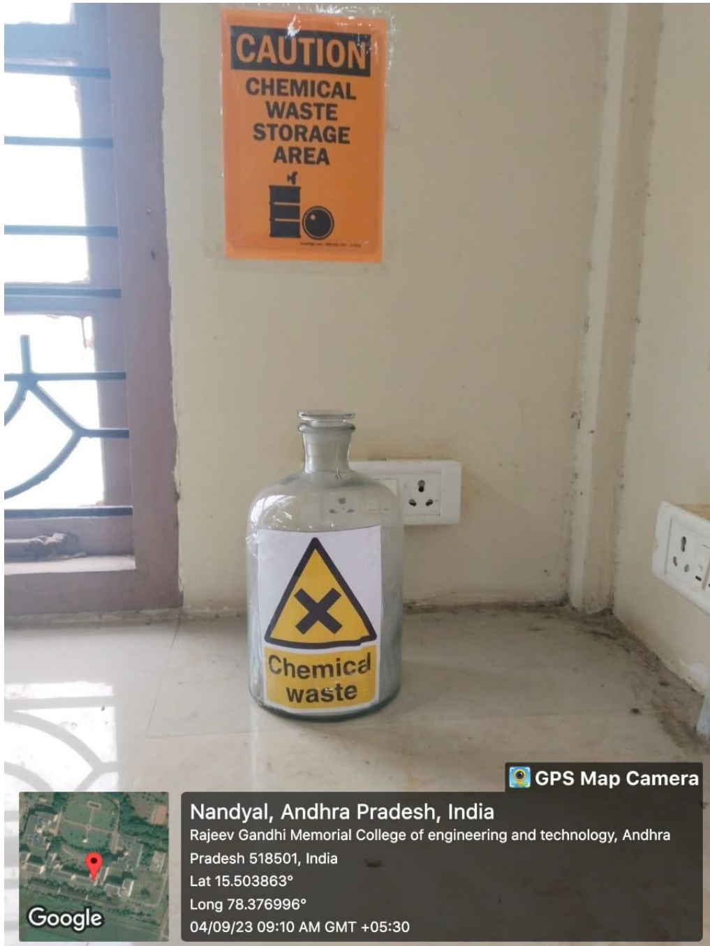
Chemical waste Collection Unit