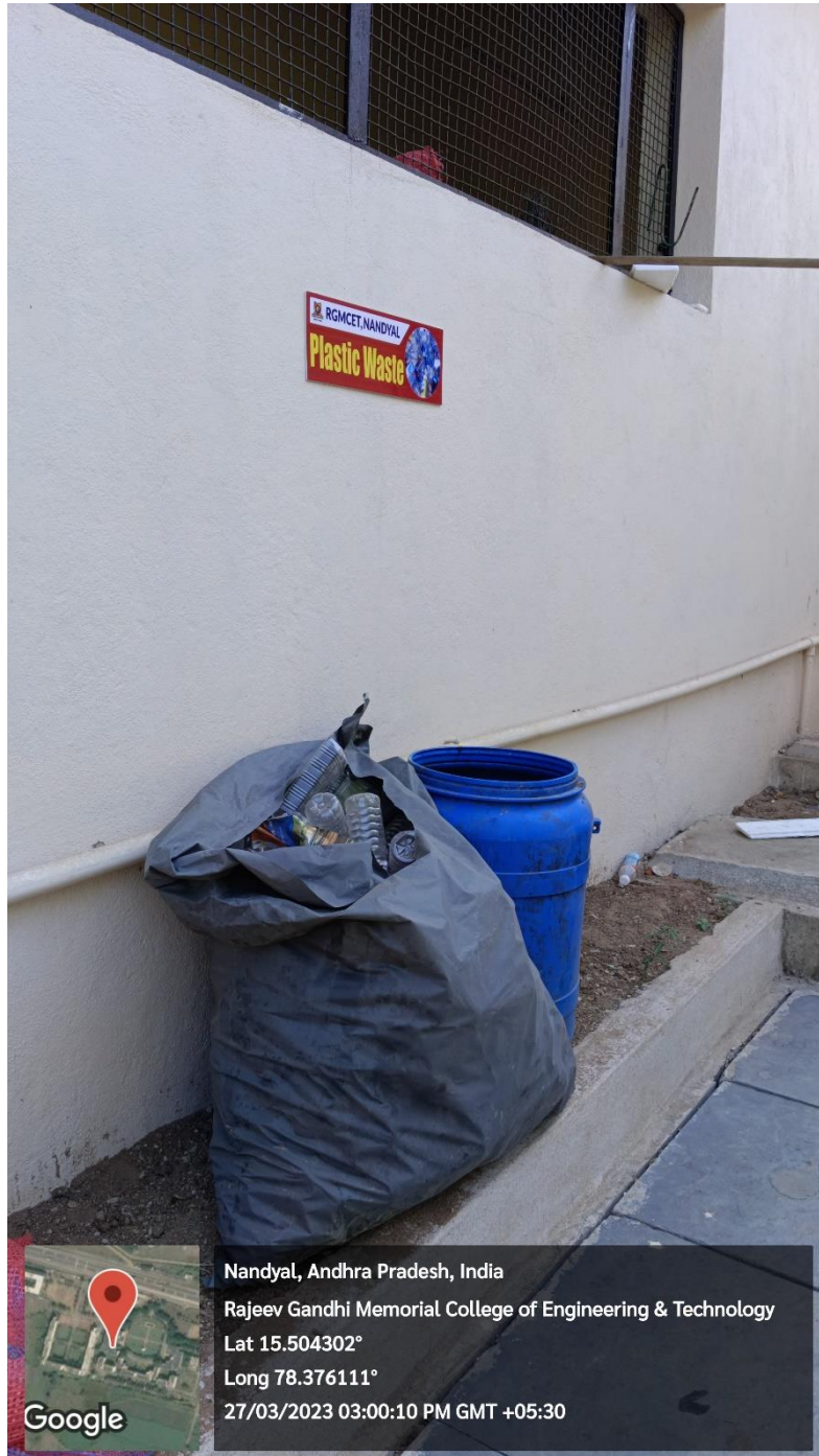
Plastic Waste Segregation System